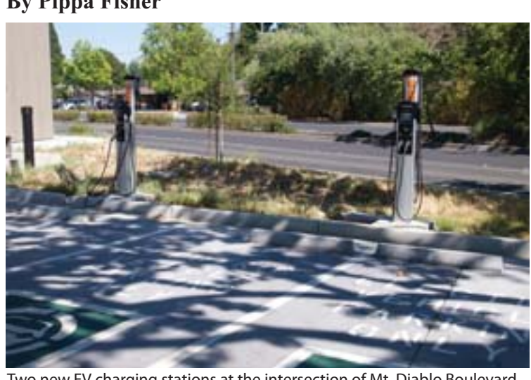
Two new EV charging stations at the intersection of Mt. Diablo Boulevard and Risa Road.

ers have more choice in locations when powering up their green Bay Area Air Quality and Managecars now since the city has installed ment District. three new ChargePoint stations.